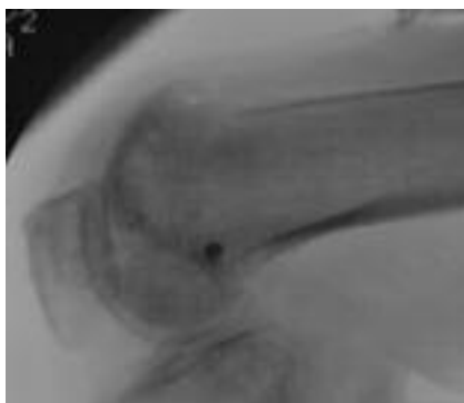
Femoral attachment site MPFL