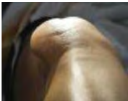
Acute, traumatic patella dislocation

First-time dislocators had relatively normal knees which were subjected to valgus external rotation overload during