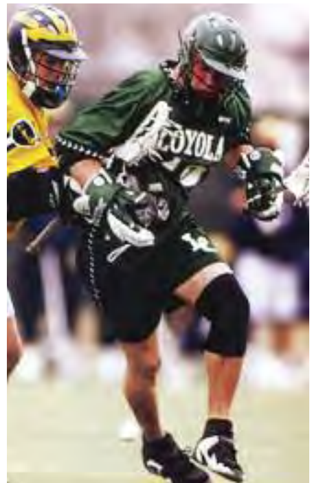
Patella dislocation is often associated with higher energy mechanisms for TONES patients

The TONES group more commonly includes patients with medial patellofemoral ligament (MPFL) disruption and concurrent osteochondral fractures; this may require arthroscopic intervention. However, this group tends to have significantly lower rate of recurrent instability. Yet, these patients are often athletic and even infrequent episodes of instability may be poorly tolerated. Prevention of future instability